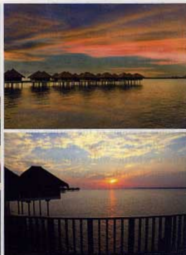
Tantalising: The natural beauty of the Straits of Malacca coastline beckons