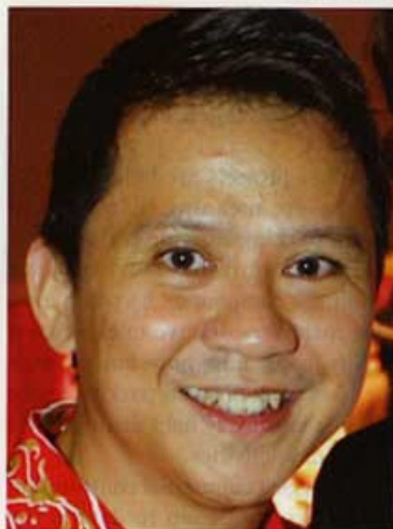
Yap: Almost 95% of our purchasers opt for the leaseback

To date, 85% of the Golden Palm Sea Villas have been snapped up. Developer Sepang GoldCoast is a 70:30 joint venture between Permodalan Negeri